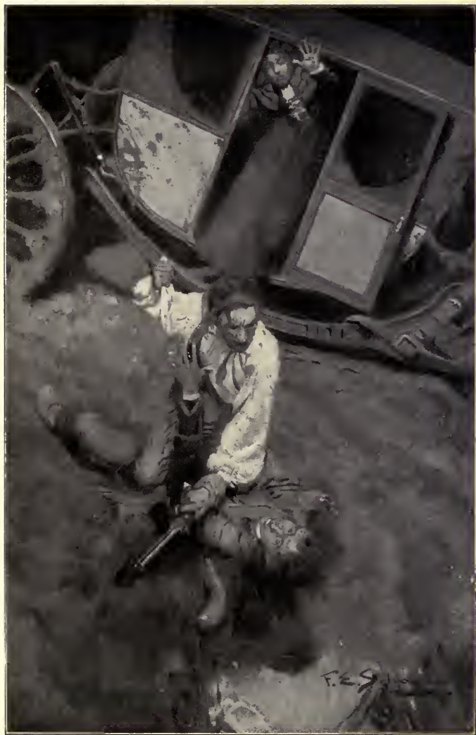
"DOWN WE WENT TOGETHER"